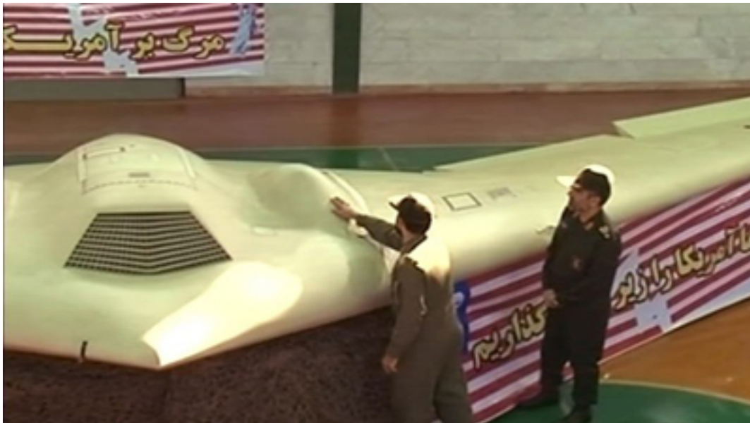
Figure 1. The RQ-170 Sentinel drone purportedly downed by Iran in December